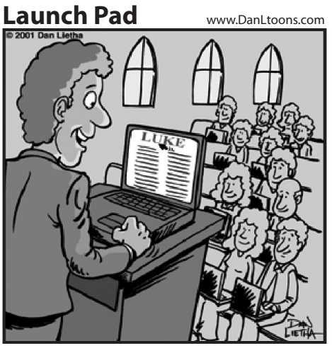
Please scroll with me in your computer Bibles to Luke, chapter 4...

-Submitted by the Arise Health Ministry Team