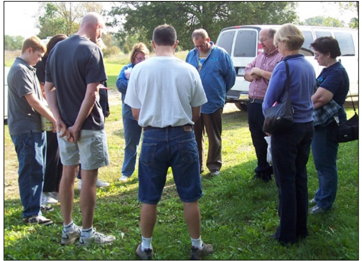
Arise CROP Walkers pause for a moment of prayer.